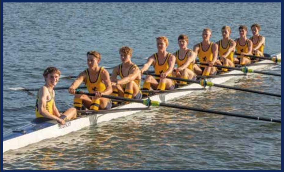
The Scots College