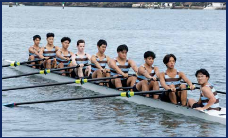
Sydney Boys High School