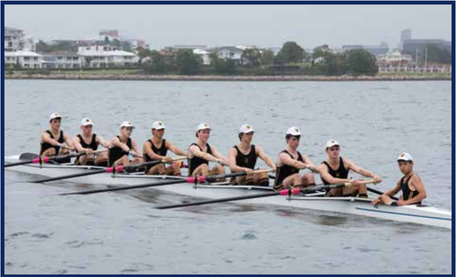
Sydney Grammar School