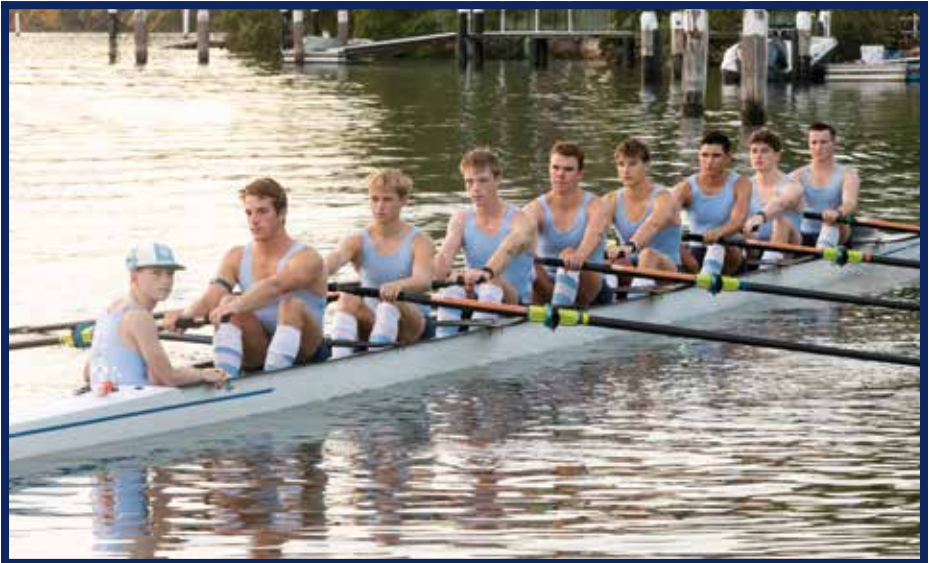
The King's School