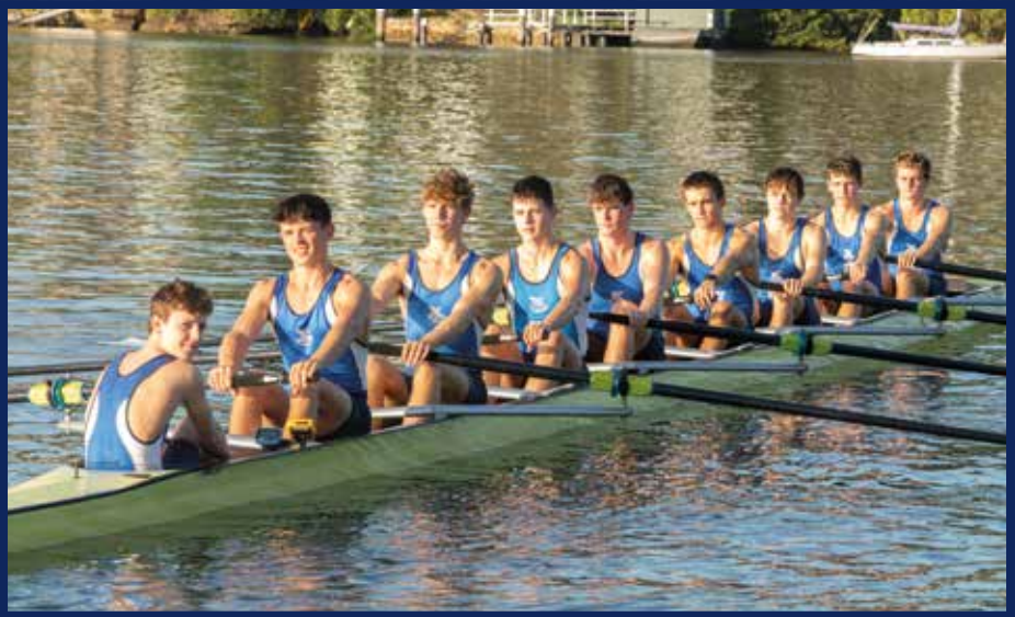
Saint Ignatius' College