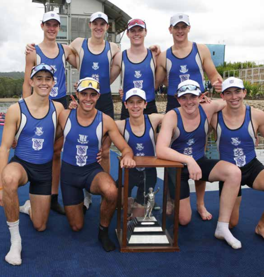
Saint Ignatius' College 1st V111, 2023 Winners of the Major Rennie Trophy