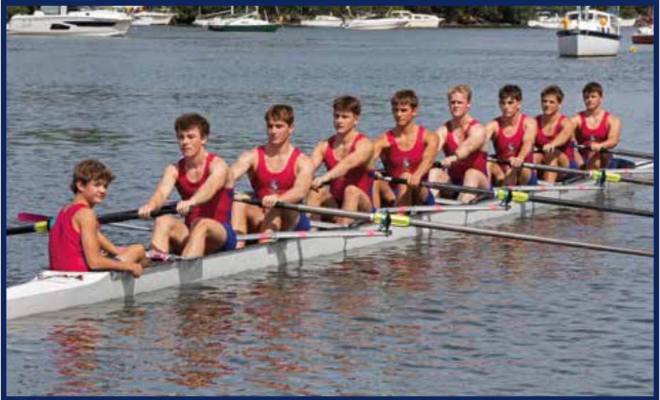
St Joseph's College